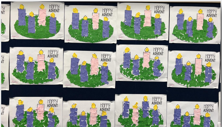
Advent art from the JLC!