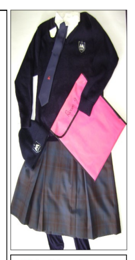
St Mary's beanie