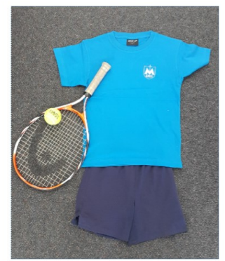
PE Gear. St Mary's T-Shirt Navy Blue shorts

Please help us! Name things in at least 7 places. That way we can return misplaced items to their rightful owner.