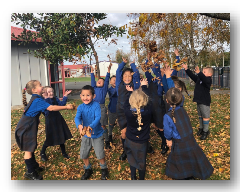
We are loving the leaves!

Also keep an eye out as we have a feature article in the River City Press.