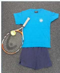
PE Gear. St Mary's T-Shirt Navy Blue shorts

Please help us! Name things in at least 7 places. That way we can return misplaced items to their rightful owner.