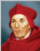
St. John Fisher Bishop & Martyr 1469 - 1535 Memorial - 22 June

St John Fisher was a Catholic bishop during the 16 th century who was martyred by King Henry VIII. In a sermon from 1508, St John prayed for good and holy bishops, asking God to send the Church true shepherds.