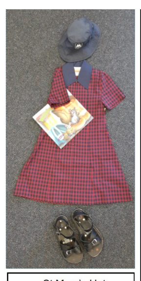
St Mary's Hat Navy and Red Tunic Black Roman or Velcro Sandals

St Mary's Hat Navy Blue Shirt Grey Shorts Black Roman or Velcro Sandals