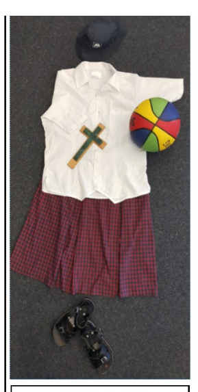
St Mary's Hat White Shirt Navy and Red Skirt Black Roman or Velcro Sandals