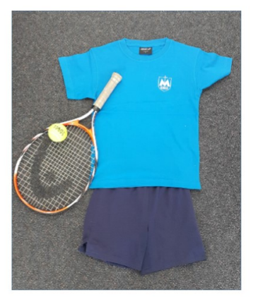
PE Gear. St Mary's T-Shirt Navy Blue shorts

Please help us! Name things in at least 7 places! That way we can return misplaced items to their rightful owner.